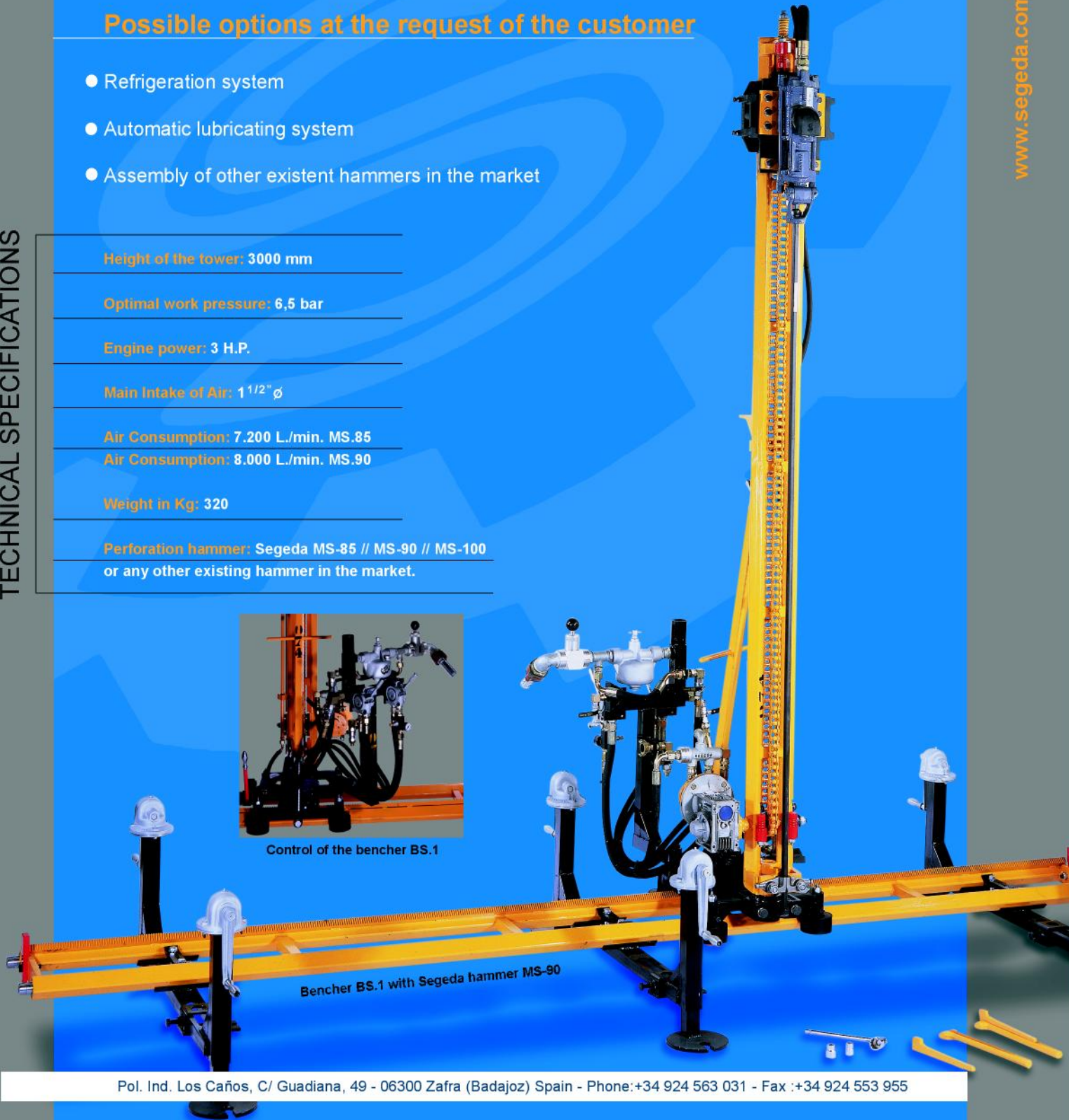
Bencher BS.1 with Segeda hammer MS-90